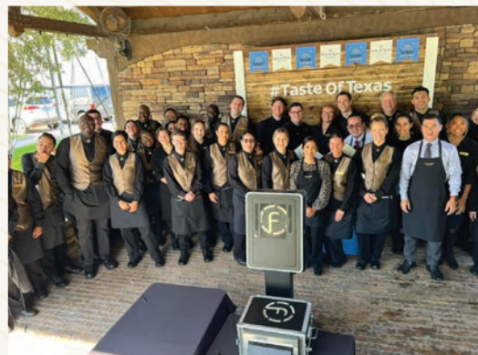
Taste of Texas staff celebrating Father's Day