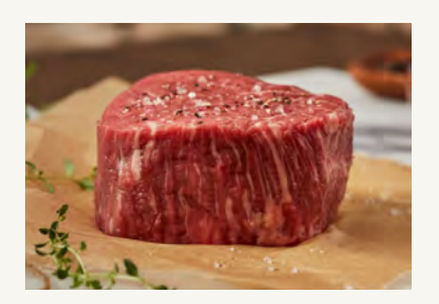
Our most popular package: Aged 40+ days and fork tender, our Center Cut Filets set the standard of exquisite tenderness and taste.

For a complete list of our steak packages, visit us at tasteoftexas.com.