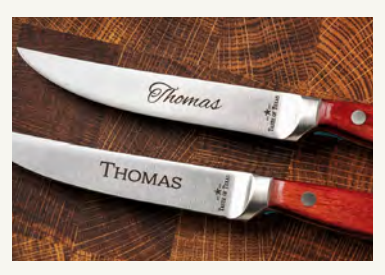
A gift with their name on it: Personalized steak knives, carving sets, and more, instantly engraved with your gift recipient's name, initials, or company logo.