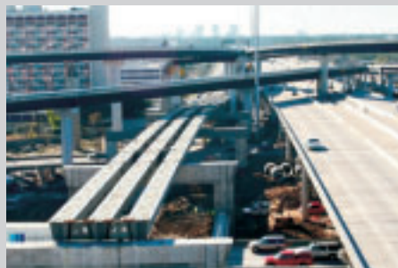
Katy Freeway at the Sam Houston Tollway

easy to get to the TASTE OF TEXAS—and well worth the trip we might add! Watch the signs—enjoy the progress—and join us in looking forward to a completed freeway within 12 months! Hats off to TXDOT for their amazing work! Feel free to